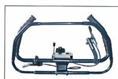
Two-step clutch finger throttle