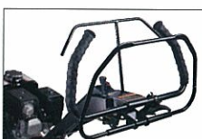
Two-step clutch "T" throttle