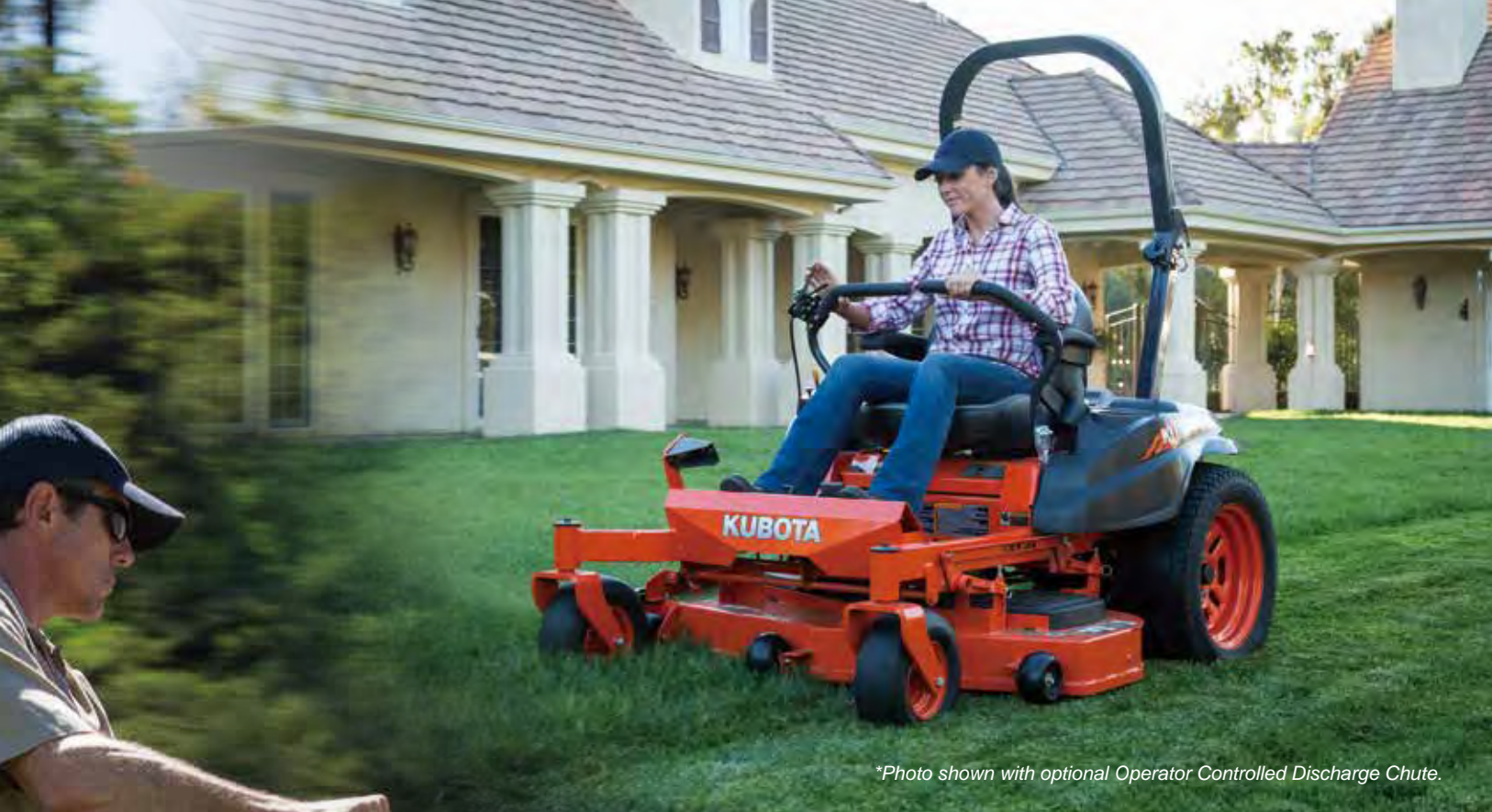
*Photo shown with optional Operator Controlled Discharge Chute.